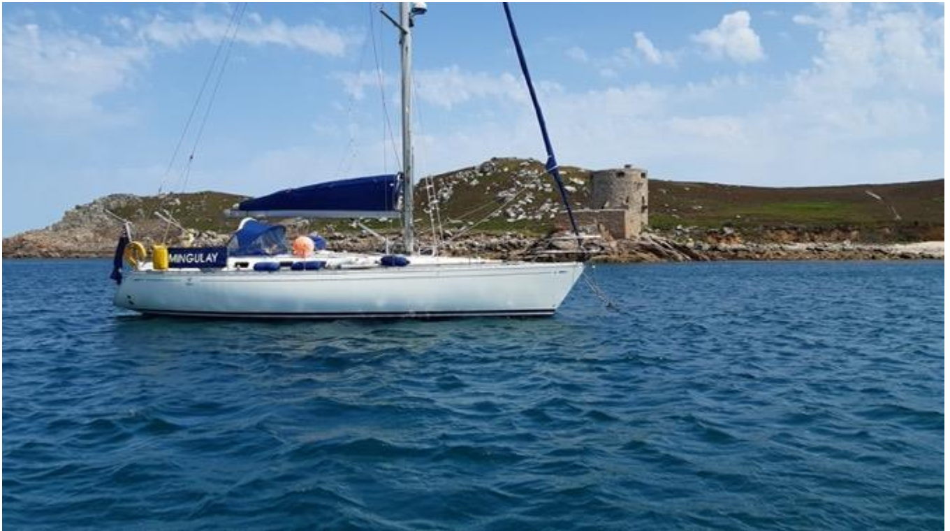
Anchored in New Grimsby Sound in front of Cromwell Castle