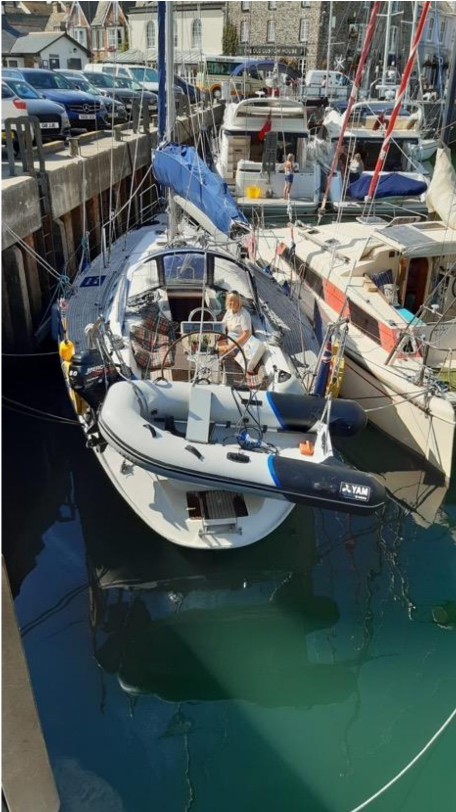
Mingulay in Padstow