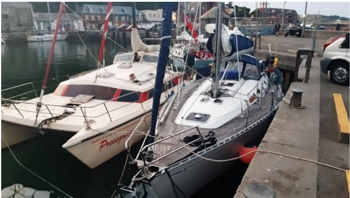
Mingulay comfortable in Padstow

We ended up staying for 4 days in glorious weather. There are so many restaurants one would need to stay for a month to make any attempt to get through them. Among them, Rick Stein has 5 restaurants with prices to cater for all!